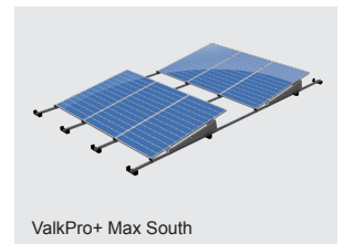
ValkPro+ Max South