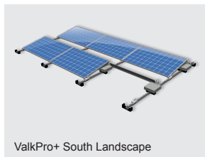
ValkPro+ South Landscape