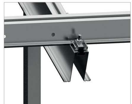
Connection detail module support