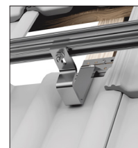
Double roman tiles