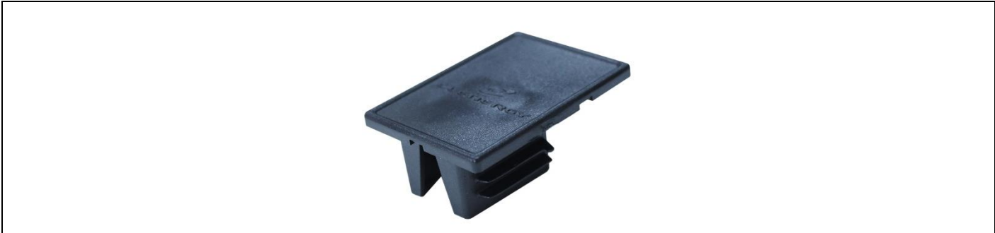
Cap for Pro Rail Part No.: ER-CAP-PRO/B